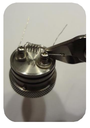
Picture 3: Use a wire cutter or any other suitable tool to cut the projecting wire ends flush with the screw heads.