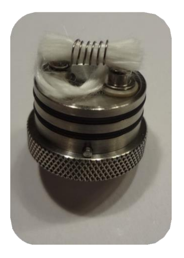
Picture 6: Now cut the Ortmann cord flush with the outer edge of the socket bottom and moisten well with liquid. In order to absorb any excessive liquid from the socket bottom, we recommend placing one strand of the cord on the socket bottom to act as a wick.

The mentioned materials and wire thicknesses are only examples; other heating wires, different numbers of windings as well as larger/smaller diameters are also possible.