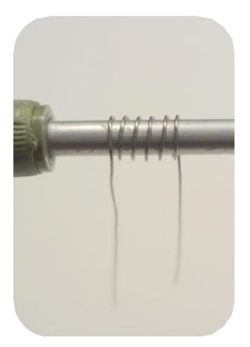
Picture 1: Wind 6 coils with 0.32 Kanthal A wire using a winding tool with a 2.5mm diameter.