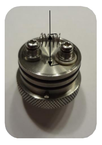
Picture 4: Note: The distance between the upper edge of the coil and the bottom of the socket may not exceed 8.5mm as it would otherwise come into contact with the chamber bottom, which might result in a short circuit.