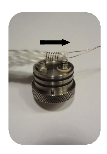
<u>Picture 5:</u> Use a wire loop to pull a double Ortmann cord through the coil.